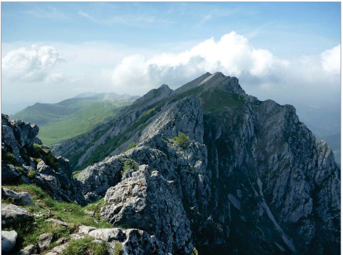
Mountain summits in Aizkorri-Aratz Natural Park, Basque Country.