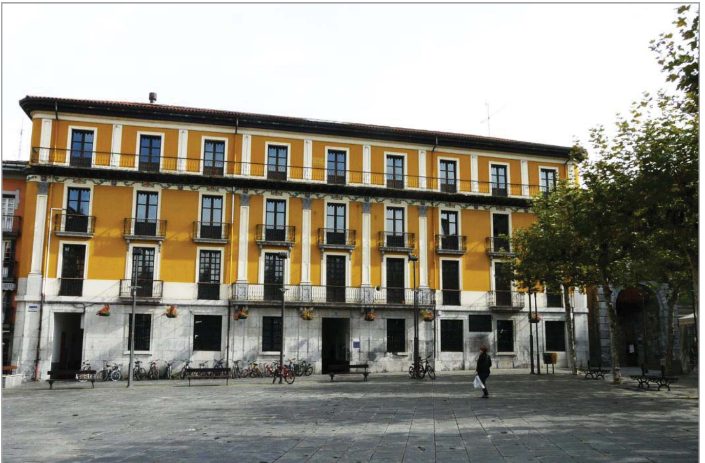
Fig. 3. Venue of the EGC in the Antonio Maria Labaien Cultural Centre (Tolosa city centre).