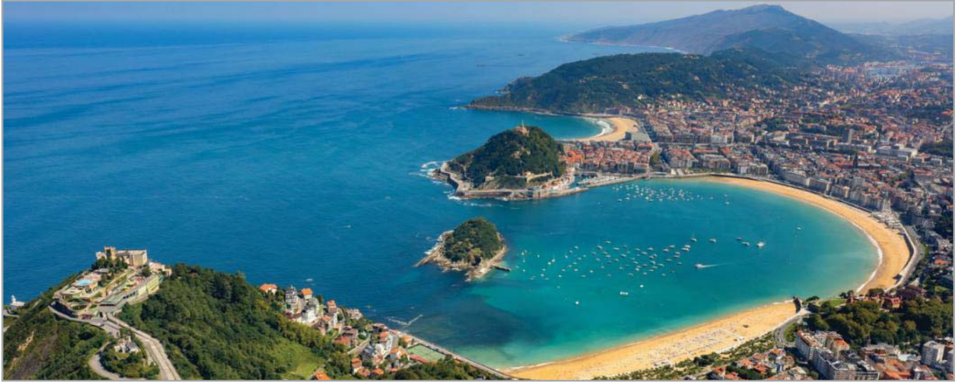
Fig. 2. View of San Sebastian, on the Cantabrian coast.